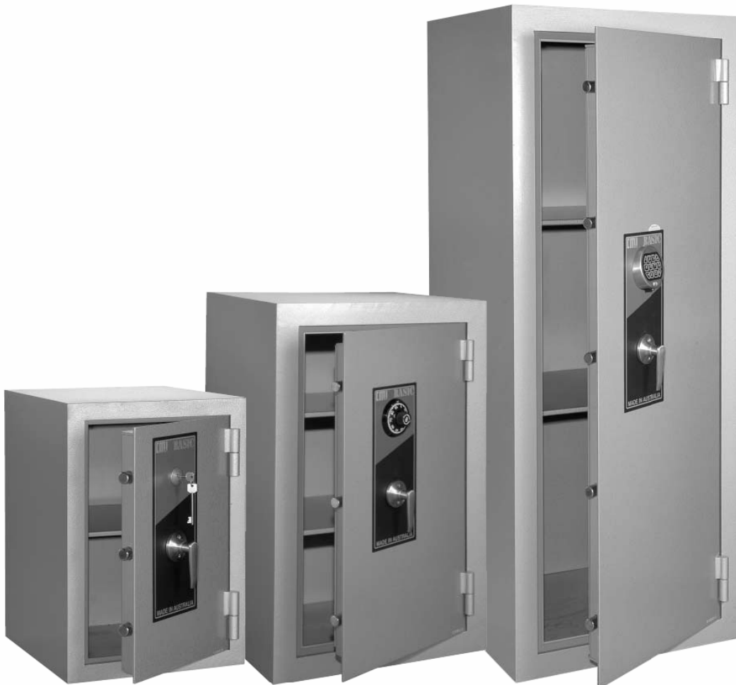
MODEL BASIC 1K